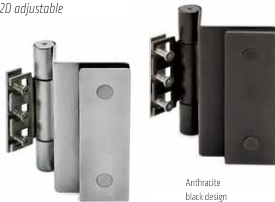
Stainless steel design