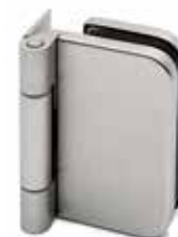
Stainless steel design