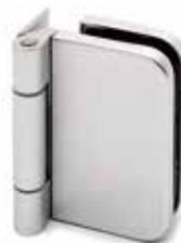
silver matt anodized