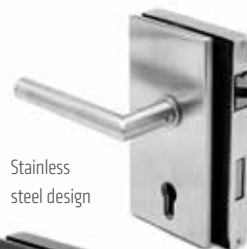
Stainless steel design