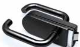
Anthracite black design