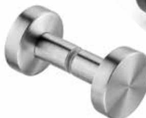
Door knob 115