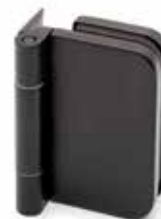
Anthracite black design