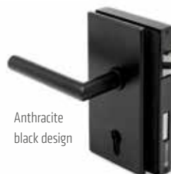
Anthracite black design