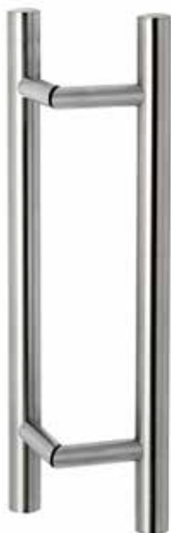
Door handle 81

Stainless steel and Chrome design L 500 - 1200 mm