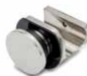
Track holder 6116

For wall-, wall/glass- and glass/glass mounting.