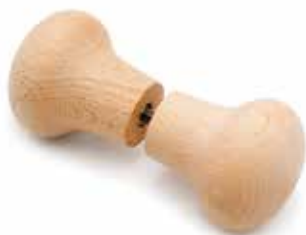
Sauna door knob 117

Stainless steel design self-adhesive L 300 - 500 mm