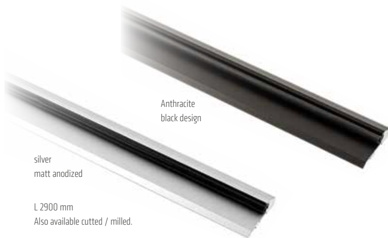
Anthracite black design