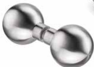
Door knob 114