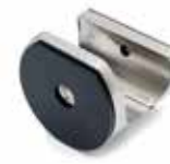
Track holder 6117