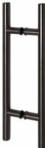
Door handle 53

Now also in Anthracite black design L 300 - 1000 mm