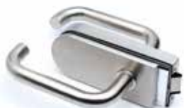
Stainless steel design